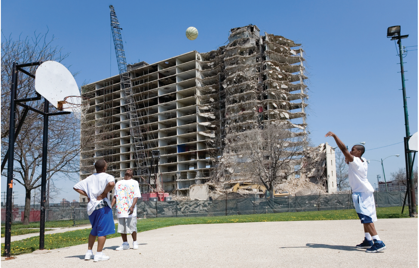
Teenagers play basketball against the backdrop of a CHA Stateway Gardens building that was demolished in 2007.

Over a period of years teams of Northwestern University sociologists intensively studied the experiences of Gautreaux moving families. When finally published, their studies described such startlingly positive outcomes in employment, income, education, even health, that they commanded national attention. (At one of the Northwestern presentations someone in the audience observed, presumably with tongue in cheek, that if moving to opportunity areas could produce Gautreaux -like results, policymakers should abandon other forms of social intervention in favor of housing mobility.)